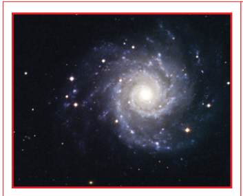
Galaxy M74 with Supernova 2013ej, from 104-cm Sampurnanand Telescope at Nainital.

How to reach: Connected from Kathgodam (broad-gauge) and Lal Kuan (meter-guage) railway stations. ARIES is about 9-km from Nainital bus stand.