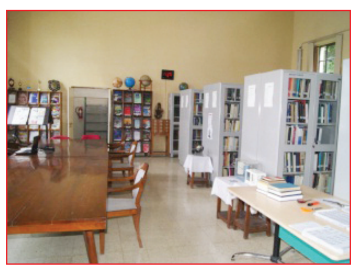
ARIES KRC/library with more than 10,000 volumes of research journals and an excellent collection of books on Astronomy & Astrophysics and Atmospheric Sciences.

Atmospheric Sciences as the field of their interest for Ph. D. degree. Research scholars are expected to submit their thesis within five years from the start of their programme. Research scholars admitted for the Ph. D. programme are initially offered a Junior Research Fellowship (JRF) and on completion of two years as JRF, as a Senior Research Fellow (SRF), with Fellowships as per DST Govt. of India norms. Research scholars are also eligible for a book grant on yearly basis, accommodation in the campus and catering facilities at nominal cost. ARIES promotes research scholars to participate in national and international meetings and conferences.