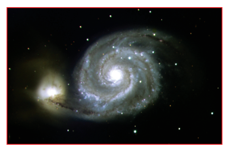
Crab Nebula in BVR from 130-cm DFOT at Devasthal