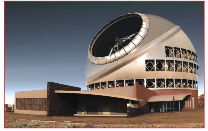
ARIES participating in the world largest 30-m Telescope which will be installed at Mauna Kea in Hawaii, USA.