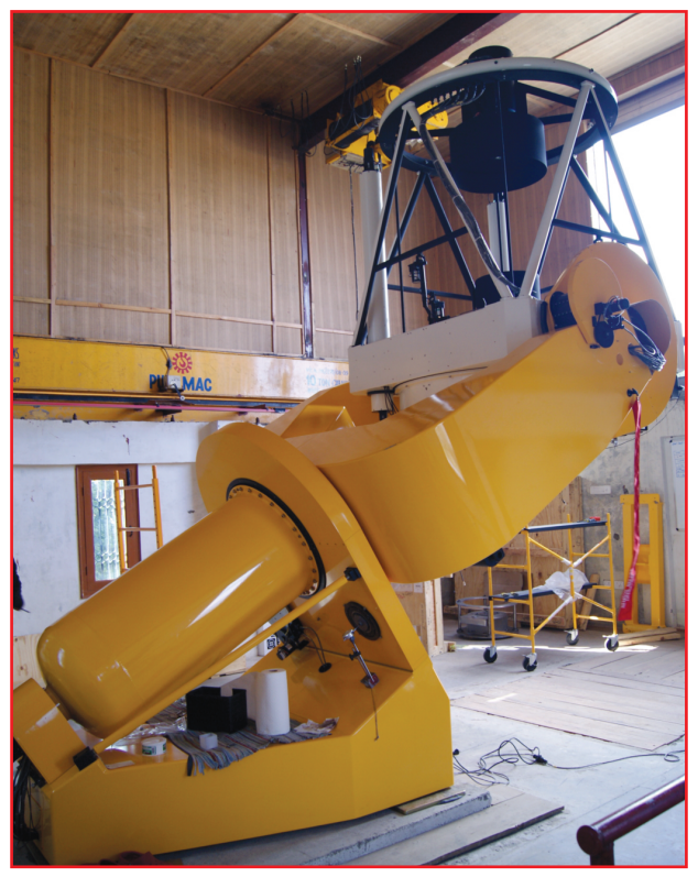
1.3-m optical telescope at Devasthal.

Devasthal Observing Station : Devasthal (latitude 29°22'22" North; longitude 79°40'57" East, Altitude: 2500 meter) is being developed as an astronomical site. The site is far from any urban development and is the most suitable for astronomical observations. A 1.3-m optical telescope has already been installed and 3.6-m DOT is expected to be ready by the end of 2014 for observations of celestial sources at optical and near infrared wave lengths.