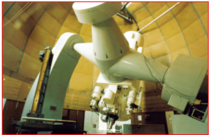
104-cm Sampurnanand Optical Telescope located at Manora Peak, Nainital.

The 104-cm telescope, known as the Sampurnanand telescope, has been the mainstay of the photometric, spectrophotometric and polarimetric observations. It is equipped with modern instruments like cooled CCD camera, spectrophotometer, and narrow and wide band filters etc. Other instruments available are Cassegrain plate holder, near infrared and photoelectric photometer. For the study of solar flares, prominences, etc. we have 15-cm Solar Tower Telescope equipped with Bernhard Halle Ha filter and fast CCD Camera.