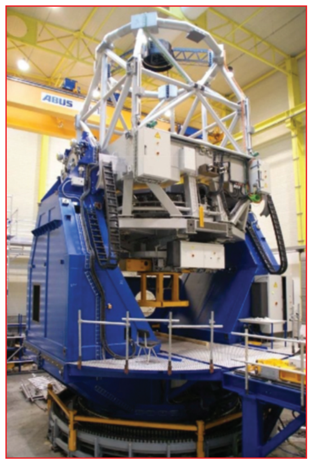
Fully assembled 3.6-m telescope at AMOS, Belgium workshop to be installed at Devasthal.