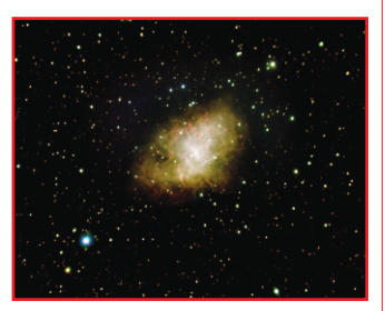
Whirlpool Galaxy (M51) with Supernova 2011dh from 130-cm DFOT at Devasthal.