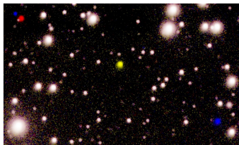
Fig. 1: Excerpt of a RGB-like composite picture consisting of the superposition of three i-band CCD frames recorded with the ILMT on the nights of 28 (blue dot), 29 (yellow dot) and 30 (red dot) October 2022. Near the red dot, an additional blue one is visible corresponding to another optical transient detected on 28 October. Most of the stars which are present on the three frames appear white-like on this picture. Visual inspection of such frames easily leads to the identification of optical transients.